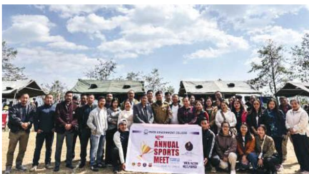
The 42 nd Annual Sports Meet of Phek Government College organized by the Sports Committee of the college, was held from 5 th -7 th March, 2025 under the theme, “Where Passion Meets Purpose,” with Addl. Dy. of Police, Chumoukedima, Shri Veni Vese, as the inaugural guest.