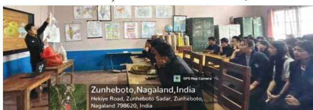
Crocheting and mushroom cultivation training organised by best practice committee in collaboration with IQAC on 08/09/2025