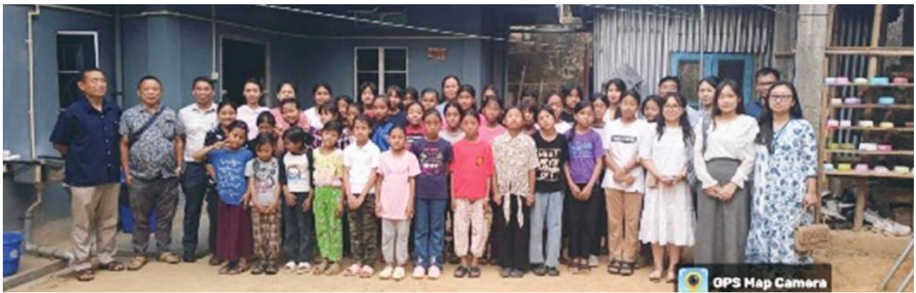
Career Guidance Programme at NECAV Hostel