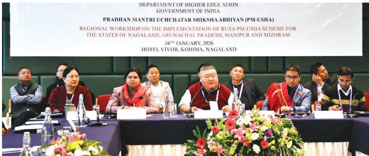
Shri. Armstrong Pame, Joint Secretary, Ministry of Education with Hon'ble Minister, Higher Education & Tourism Nagaland & Department Officials.