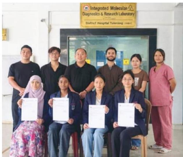
The 1 st batch of Science students from Sao Chang College, Tuensang