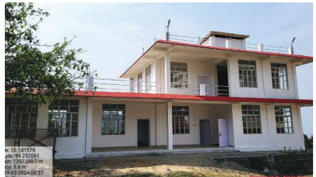
Academic buliding at Mount Tiyi College Constructed under RUSA 2.0