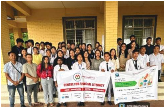
Financial Literacy Awareness