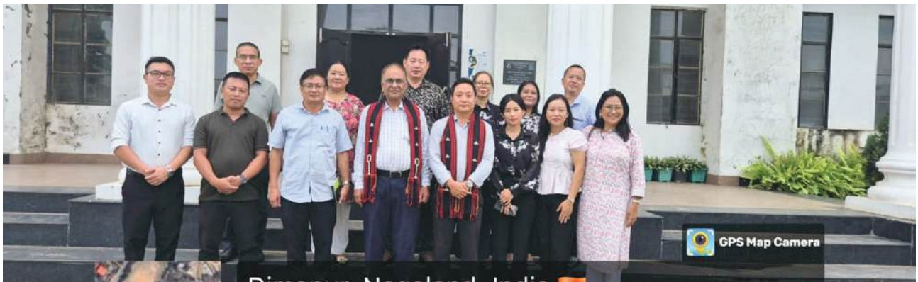
Inspection of NU Team for Science Departments was held at DGC on 12 th September 2025 – Chemistry, Computer Science, Mathematics and Physics.