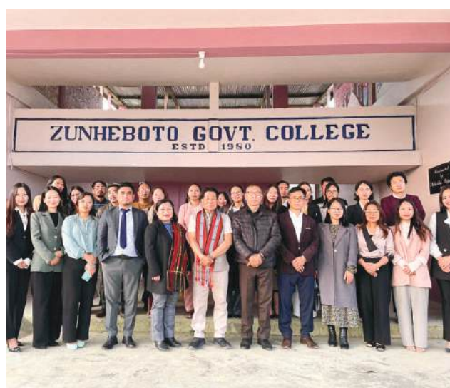
AAA visit to college for the 2 nd NAAC cycle on 14/04/2025