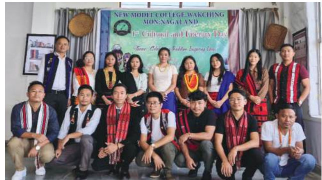
First Cultural & Literary Day 14 th October, 2025