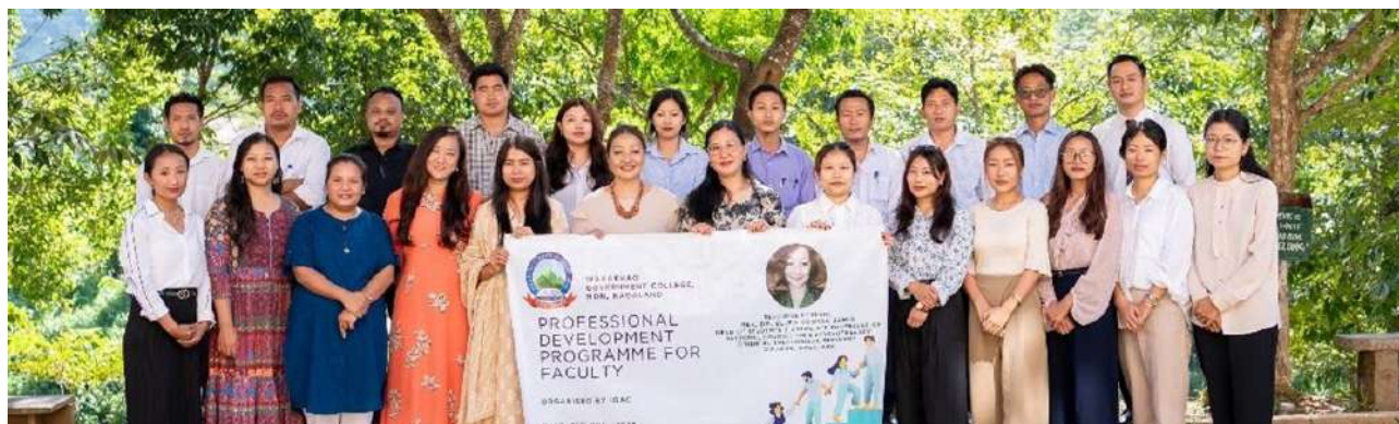
Professional Development Programme for Faculty 21 st Oct., 2025