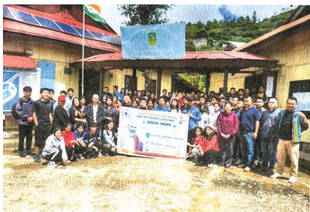
Pfutsero Government College received the 1 st Position in the Swachh Bharat Abhiyan-Social Work competition held on 17 th Sept. 2025, organised by the Department of Higher Education in collaboration with the Department of Tourism, Government of Nagaland.