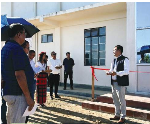
Inauguration of Faculty Quarters