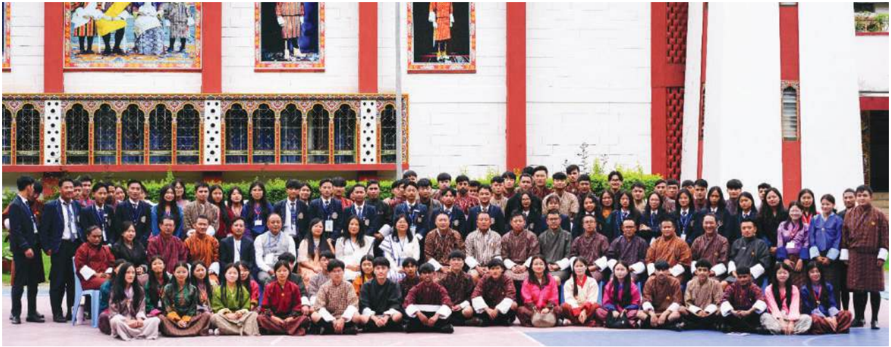
3-Day Academic and Cultural Exchange Programme between Fazl Ali College, Mokochung and Sherubtse College, Royal University of Bhutan