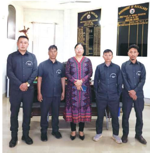
Directorate Driver representatives with Ex-Officio Director