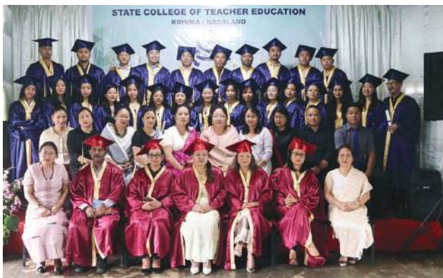
2 nd Graduation Programme on 14 th August 2025