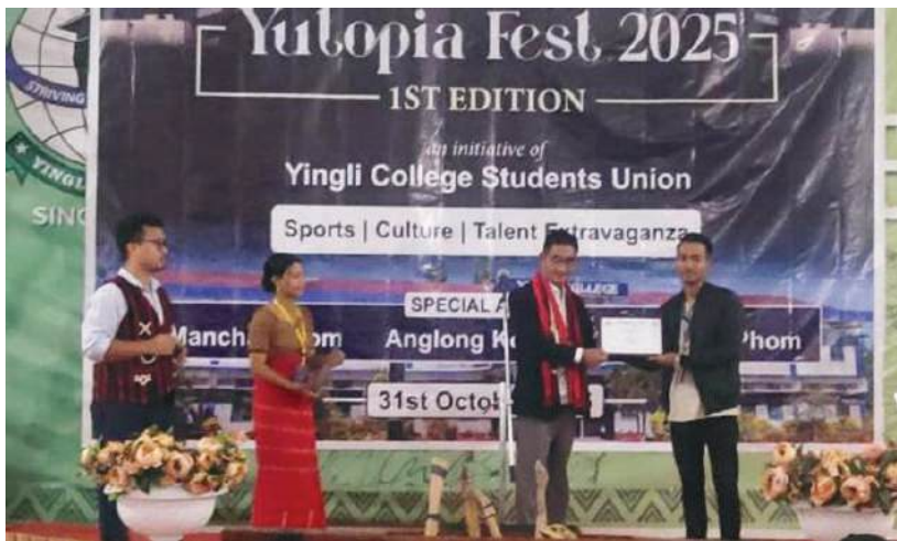
Celebration of First Edition of Yutopia Fest