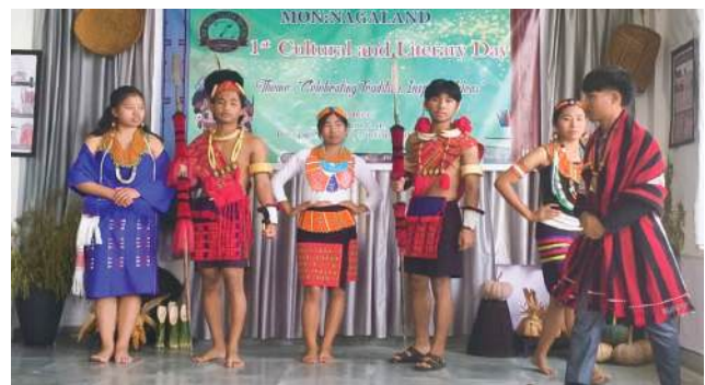
First Cultural & Literary Day 14 th October, 2025