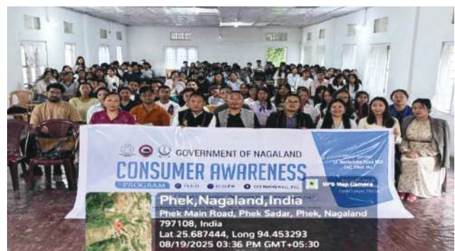
The Department of Legal Metrology and Consumer Protection (LM&CP), Phek, in collaboration with the Internal Quality Assurance Cell (IQAC) of Phek Government College, organised a consumer awareness programme on the theme “Legal metrology and consumer protection: the journey towards Viksit Bharat 2047” at the college campus on 19 August, 2025.