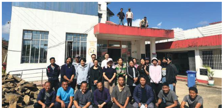
Social Work 12 th November 2025