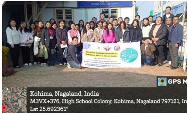
Capacity Building Program under the theme "NashaMukt Bharat Abhiyan" organised by IQAC, from 27 th - 28 th February 2025 focusing on Substance Abuse Prevention and Mental Health