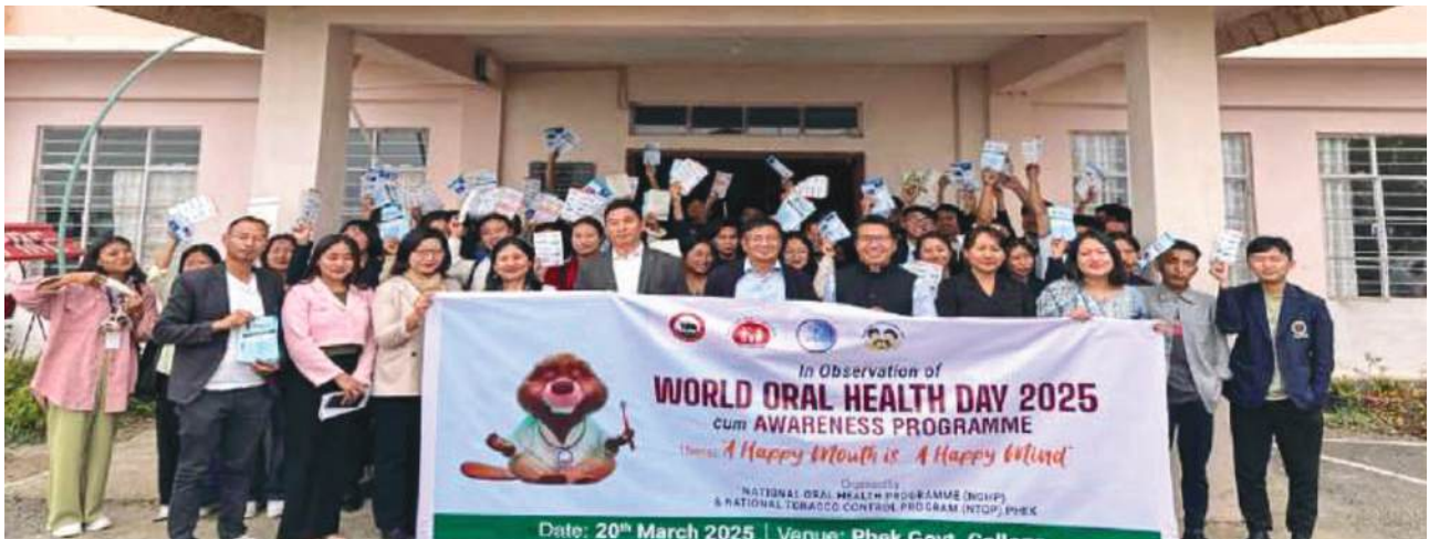
Phek Government College, Phek in collaboration with National Oral Health Program (NOHP) & National Tobacco Control Program (NTCP) organised a programme on account of World Oral Health Day on 20 th March, 2025 under the theme, “A Happy Mouth is a Happy Mind” within the college premises.