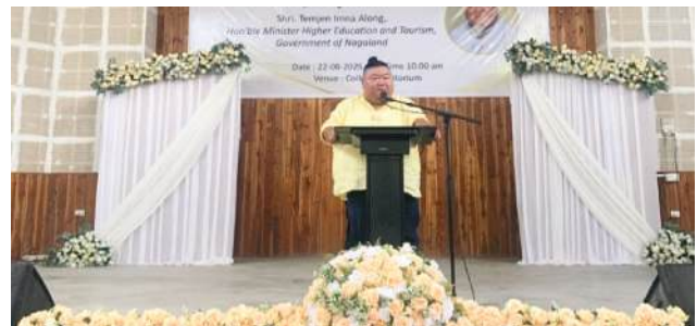
58 th Fresher's Meet celebrated with Special Guest Shri. Temjen Imna Along, Hon'ble Minister Higher Education and Tourism, Government of Nagaland, at DGC, 22 nd August 2025, under the theme "Weaving Tomorrow with Today"