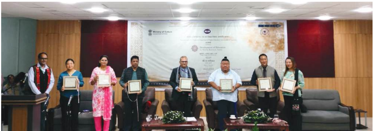
The National Archives of India, in collaboration with Higher Education organised a 5 days exhibition titled, “Development of Education in North Eastern India, from 8 th to 14 th August 2025 at the Capital Convention Centre, Kohima.