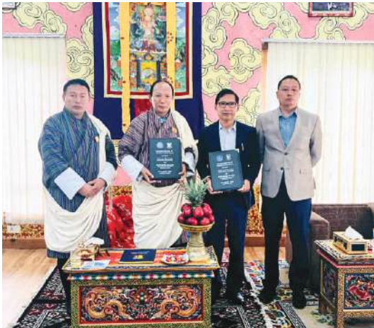
MoU signed with the Sherubtse College Royal University of Bhutan