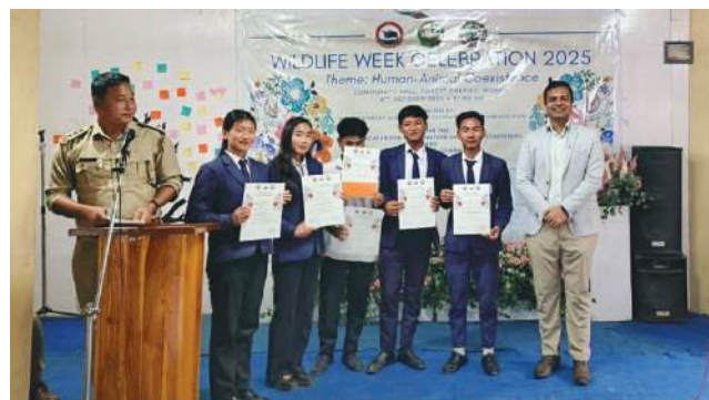
A debate competition held during the Wildlife week celebration, 2025 on the theme “Human-Animal Coexistence” organized by Wokha Forest Division and Doyang Plantation Division on 8 th October 2025. Mount Tiyi College was the awarded First Position in the competition.