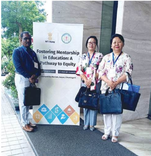
Dept. Officials representing State for NITI Aayog Workshop on Fostering Mentorship in Education held on 29 th August 2026 at Raipur, Chhattisgarh.