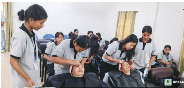
Skill Training imparted by the Skill Club, DGC on Beautician and Makeup Artist (The trainee students offering free service to the faculty & staff)