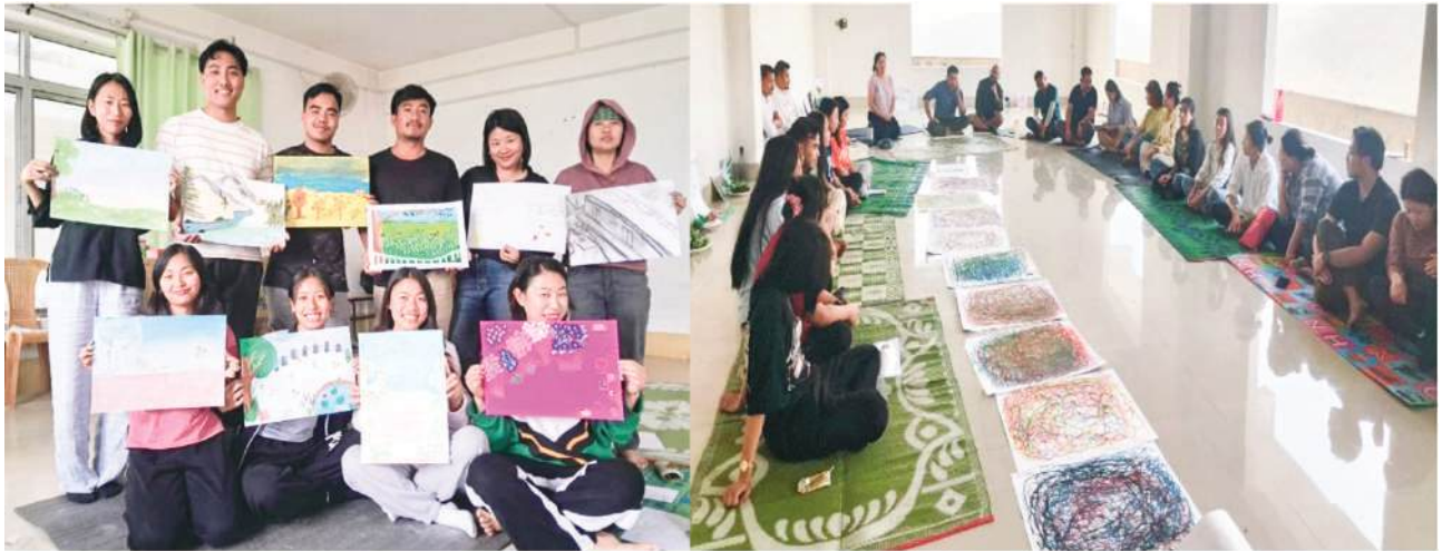
4-Days Workshop on Expressive Art Therapy (Hybrid Mode) in collaboration with Art Adventures Studio: April 11 & 12, 2025 (Online Mode) and April 25 & 26, 2025 (Offline Mode).