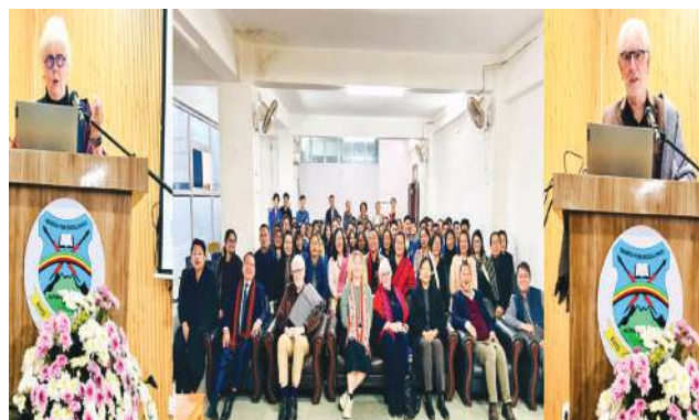
International Public Lecture On Ireland And The Empire