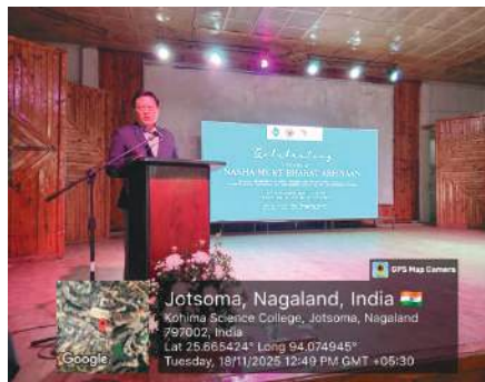
Nasha Mukta Bharat Aviyan