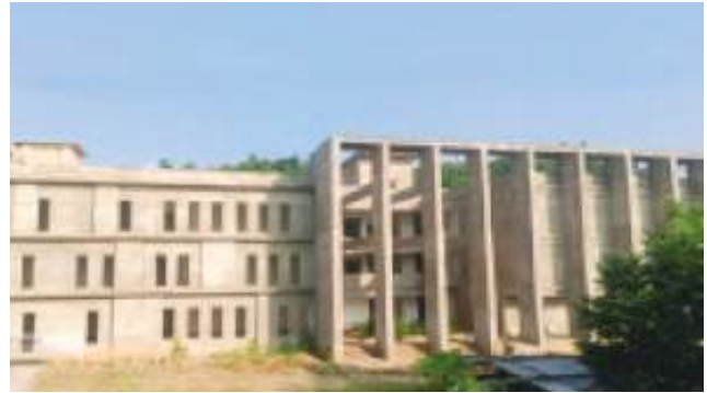
New College (Professional) - Engineering College at Tsurangsa, Mokokchung District (RUSA 2.0)