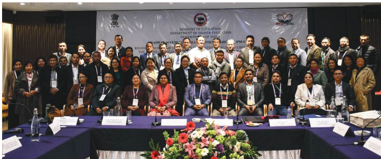
A portait of the Officials and College representatives