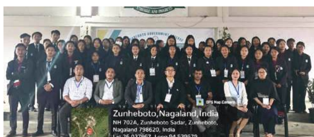
National Workshop on Research Methodology conducted on 08/08/2025 by Research committee and IQAC.