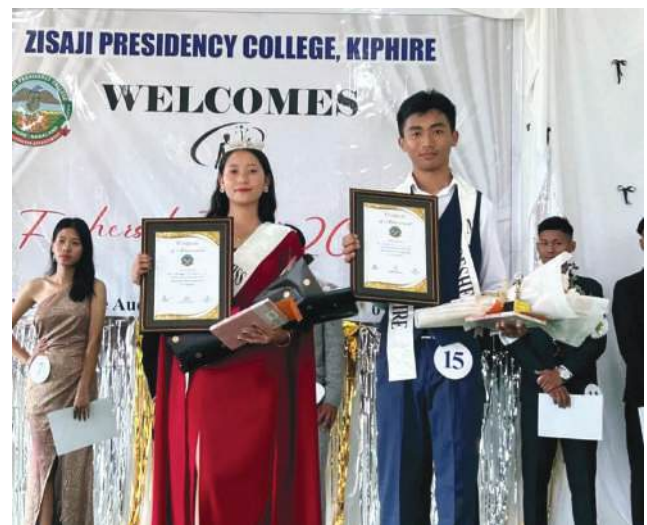
Fresher's Day, 7 th August 2025