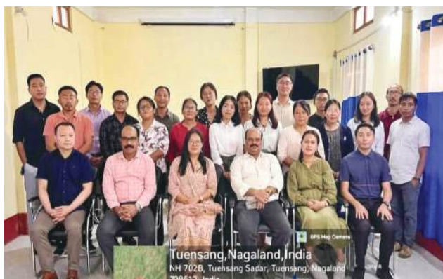
One day workshop in article writing