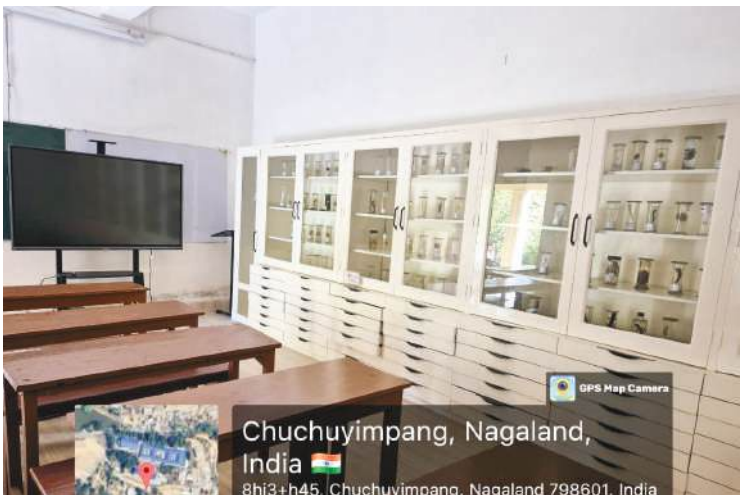
Aviary and Entomology Museum under the Dept of Zoology