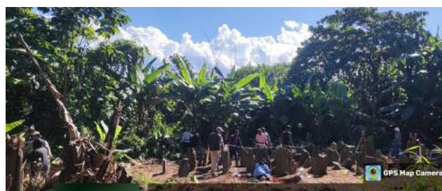
History Department of the College providing Extension service at Excavation Site, Yannyu village, Mon by Nagaland University in collaboration with Kiel University, Germany on 21 st Nov., 2025