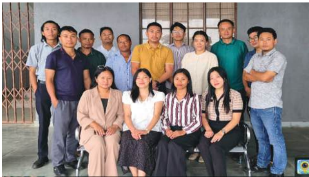
IQAC constituted on 19 th July, 2025