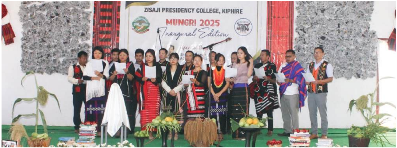
Mungri: The College Week