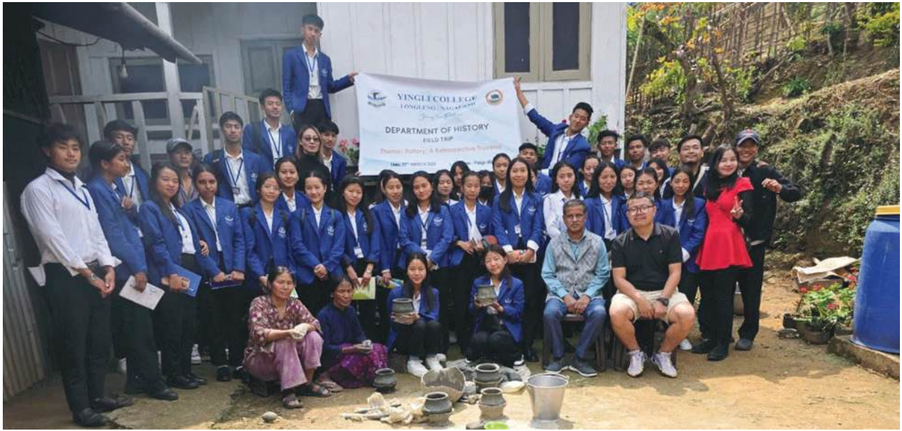
History Department Field Trip on Pottery and Pottery Making at Pongo Village Longleng on 22 nd March 2025