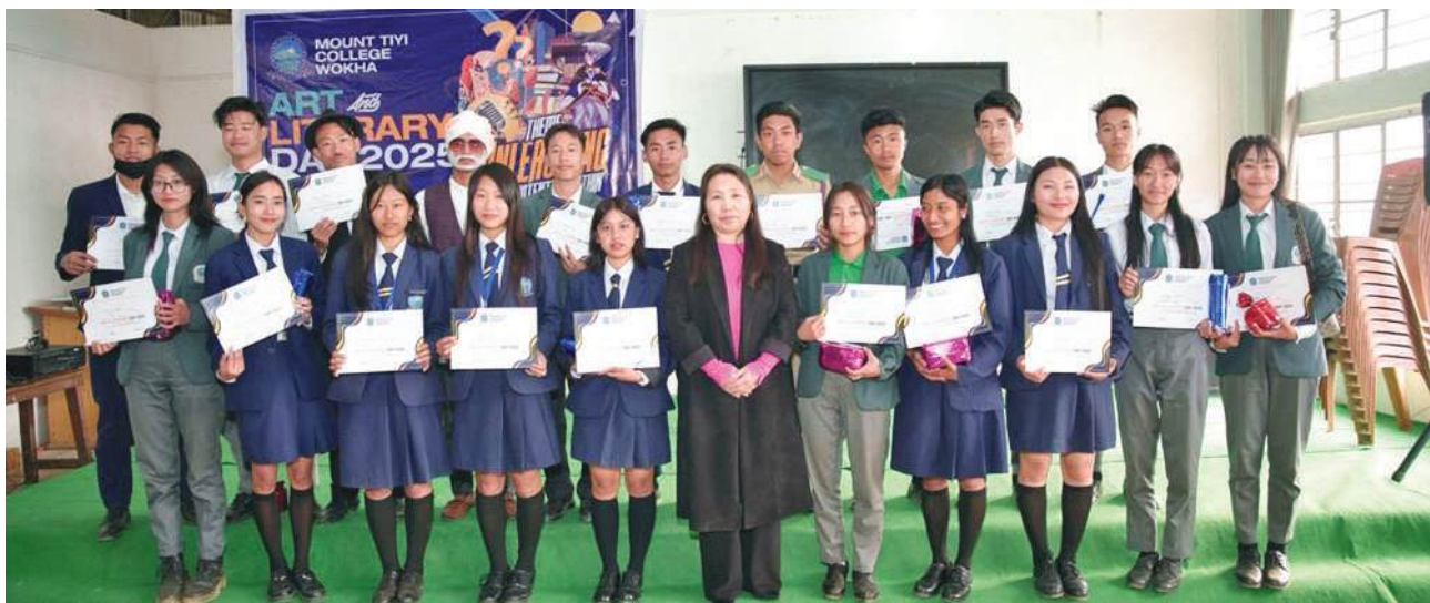
Art and Literary Day observed on 11 th March 2025 on the theme “Unleashing the potential within” organized by Literary Committee, MTC.