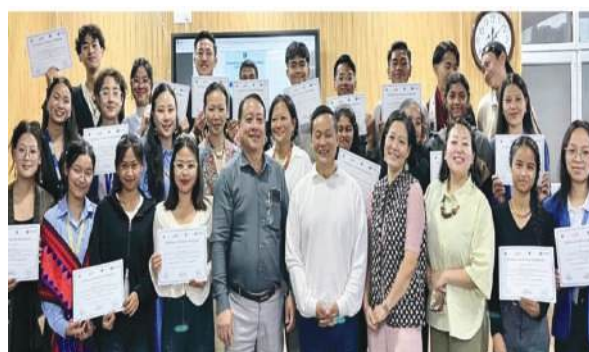
Entrepreneur Development Course Conducted For The Students In Collaboration With Youthnet