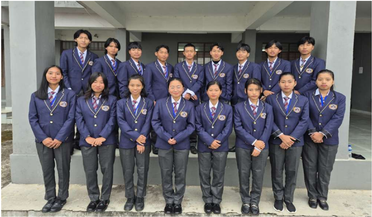
Students in their first official uniform