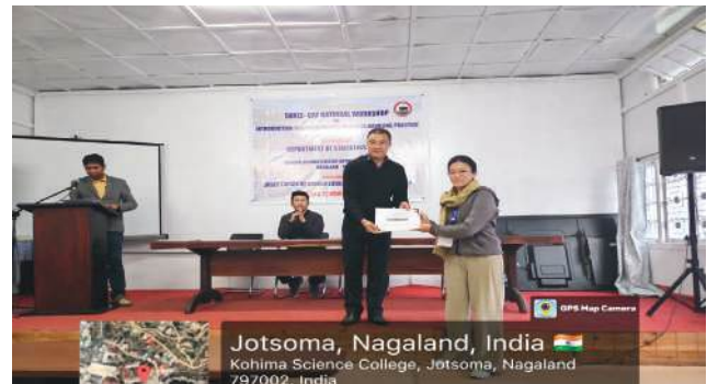
3-day workshop on SPSS