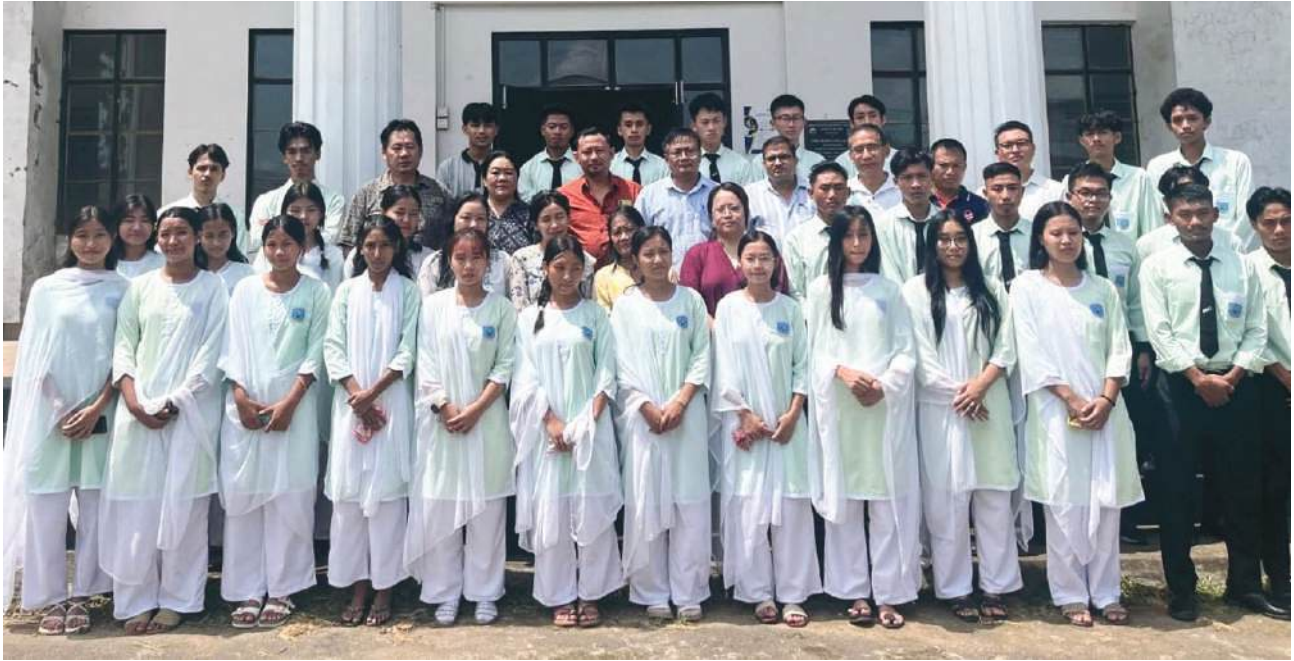
Commencement of Science Stream at DGC from Academic year 2025. 1 st Batch of Science Students 2025-26, Dimapur Government College