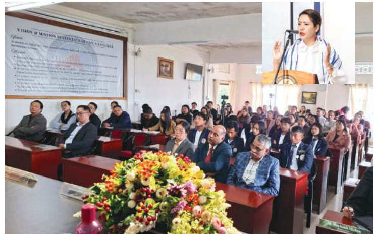
First FAC Annual Lecture held on the theme: "Quality Education for Indigenous Research and Nation Building"