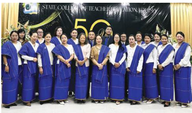
Golden Jubilee Celebration of SCTE-K 7 th Nov.2025