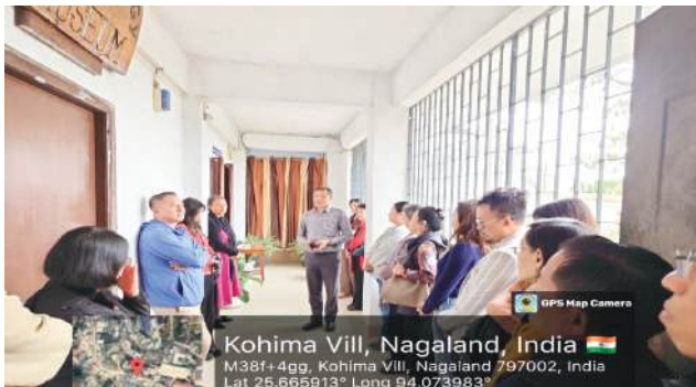
Inauguration of Beauty and Wellness Centre