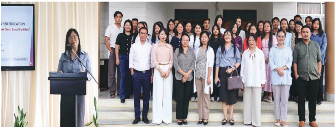
One-Day Workshop on Communication Skills: Speak Clear, Sound Confident: October 9, 2025