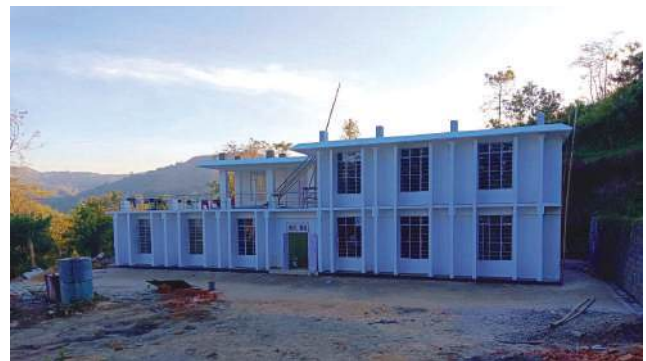
Girls hostel at Kohima College, Kohima constructed under RUSA 2.0