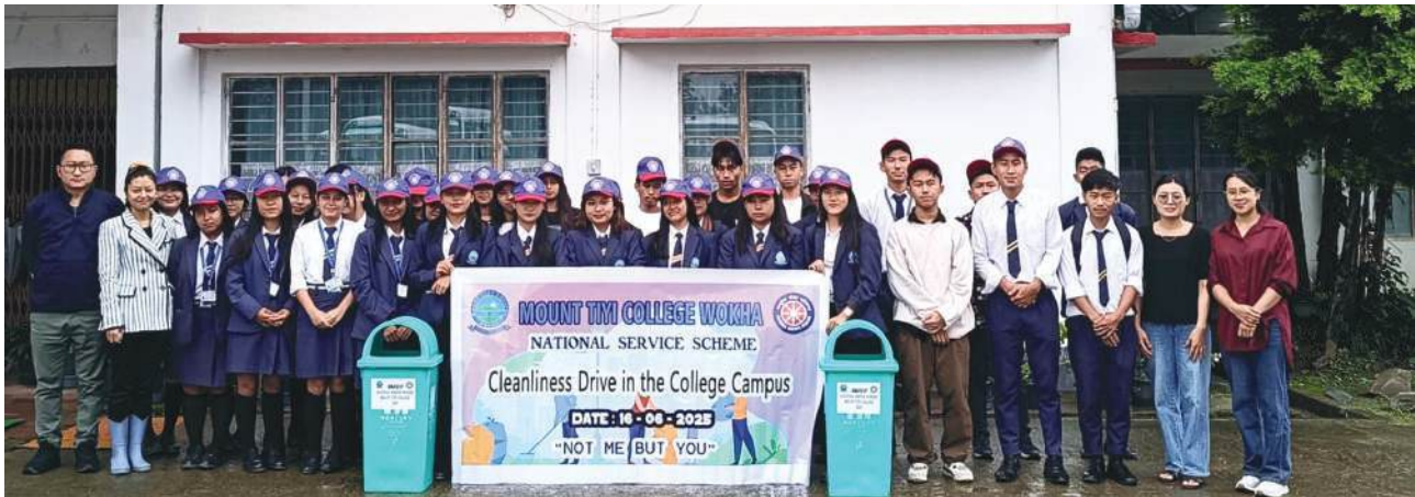
The NSS, MTC organized a cleanliness drive in the college campus under the theme “Not Me But You” on 16 th June 2025.