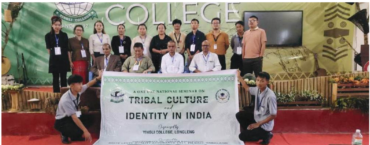
One day National Seminar on "Tribal Culture and Identity in India" on 16 th October 2025.