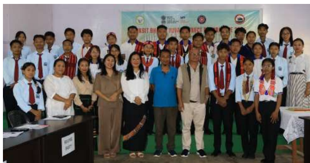
Viksit Bharat Yuva Connect Youth Parliament and Debate, 6 th Aug., 2025