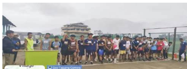
National Sports Day