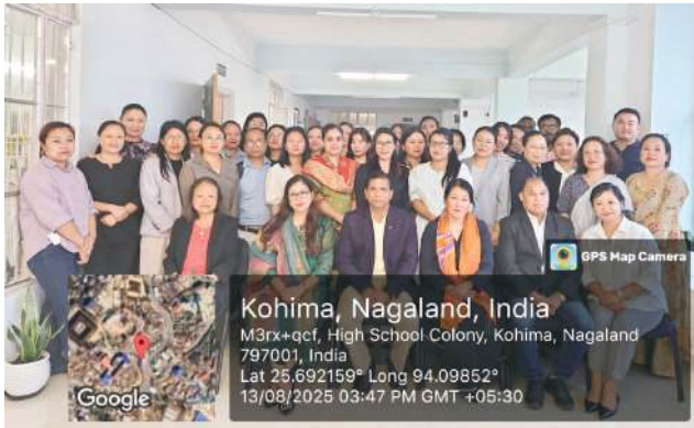
2-Day State Level Workshop on Instructional Planning from 12 th to 13 th August, 2025 for faculty of Secondary Teacher Education Colleges of Nagaland.