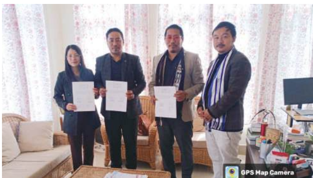
Faculty exchange programme was held on 12 th March 2025 with the Department of Political Science, MTC and the Department of Political Science, Bailey Baptist College, Wokha