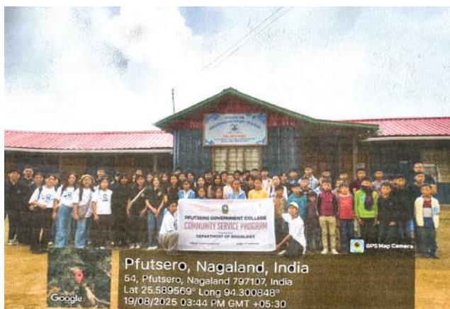
The Department of Sociology, Pfutsero Government College, visited Rukizumi Children Home for a combined fellowship and interactive outreach session on 19 th August 2025.