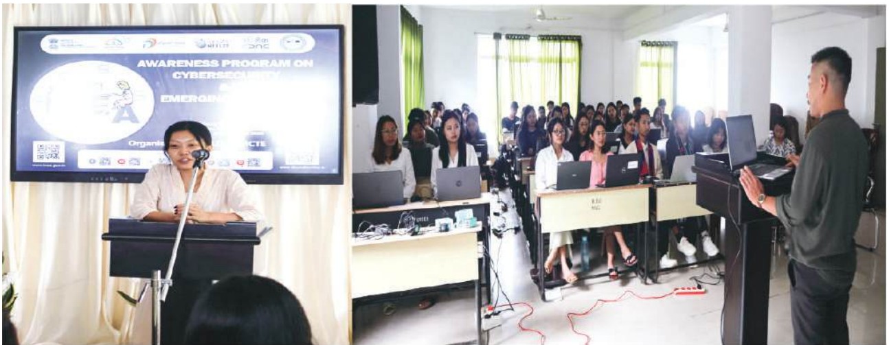
Awareness Programme on Cyber security & Emerging AI Tools and Hands-on Training in Digital Productivity Tools in collaboration with NIELIT: September 10-12, 2025..