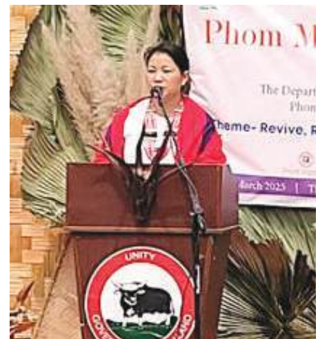
Celebration of Prelude to Phom Monyiu on 28 th March 2025