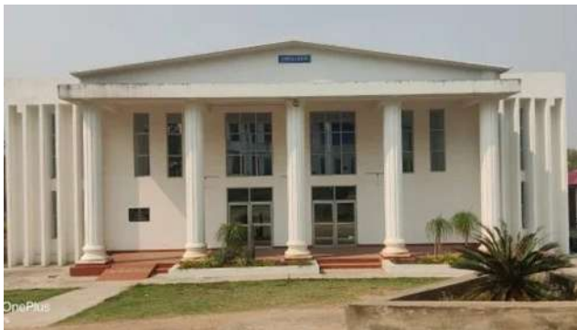
Library building at Dimapur College constructed under RUSA 2.0