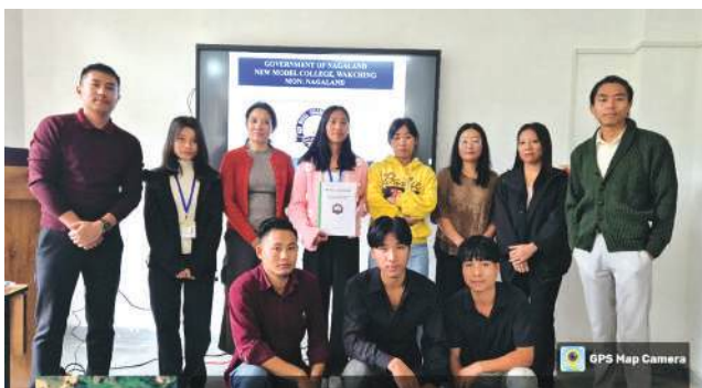
Formal Release of NMCW Students' Council Constitution 30 th October, 2025