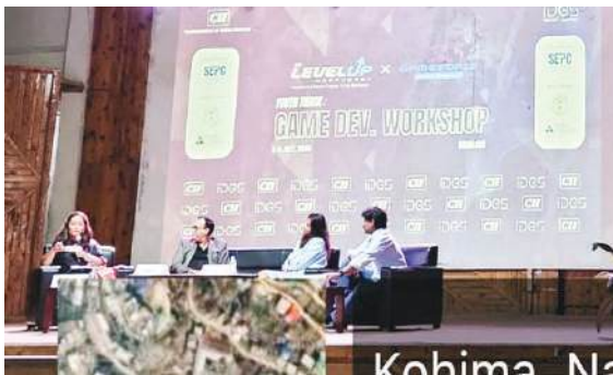
Game Development workshop