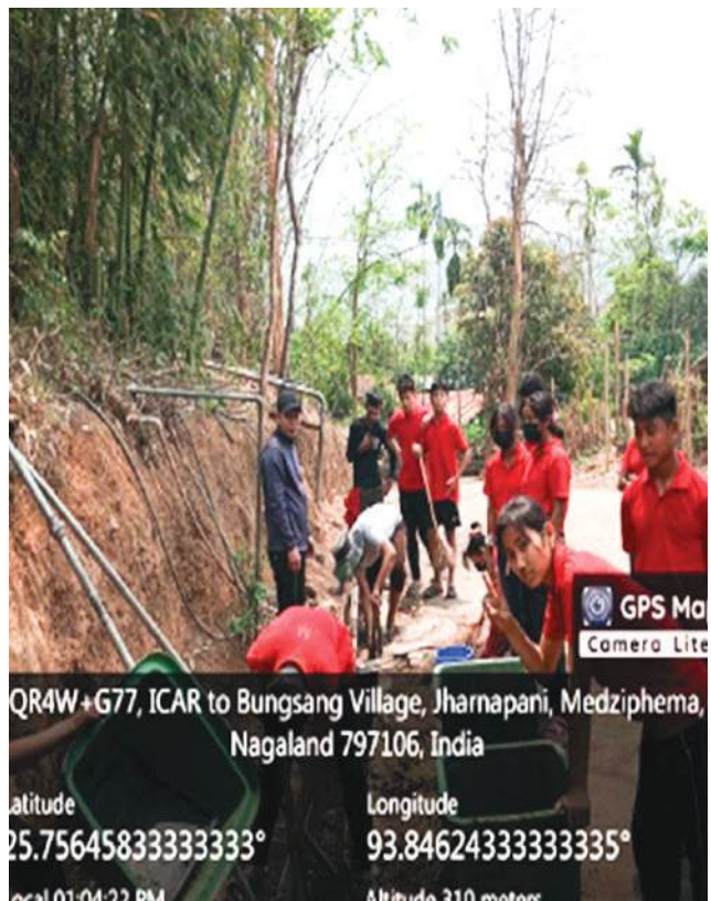
Cleanliness Drive by B. Ed student teachers during Community Engagement