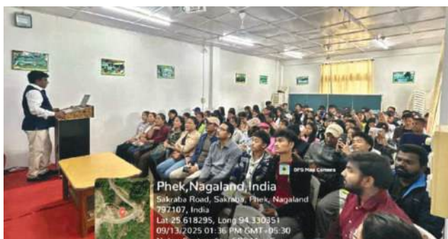
A One-Day Educational-cum-Field Trip for Ist Semester EVS students and BSC students was organised by the Science Club of Phek Government College on 13 th September, 2025 to ICARNRC, KVK Porba, Phek.