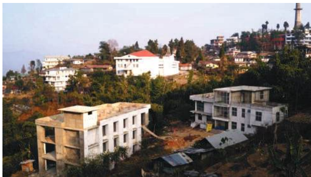
ST Girls Hostel and Research Hostel at Kohima Science College (A) Under RUSA 2.0